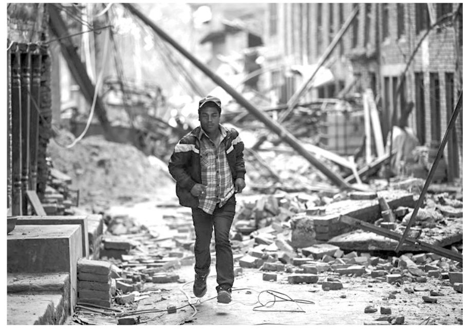
A man runs past damaged houses as aftershocks of an earthquake are felt a day after the earthquake in Bhaktapur, Nepal April 26, 2015. Rescuers dug with their bare hands and bodies piled up in Nepal on Sunday after the earthquake devastated the heavily crowded Kathmandu valley, killing thousands, and triggering a deadly avalanche on Mount Everest.