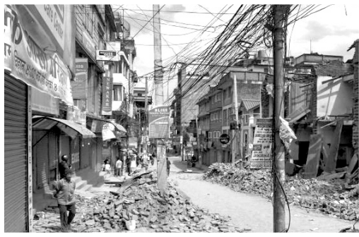
The 7.8 magnitude earthquake that struck Nepal on April 25, the most powerful quake in 81 years to hit the region, caused significant loss of life and damage.

That response is assisted further by the fact that UMN had the foresight to assign one of its officers to participate in UMCOR's most recent regional disaster