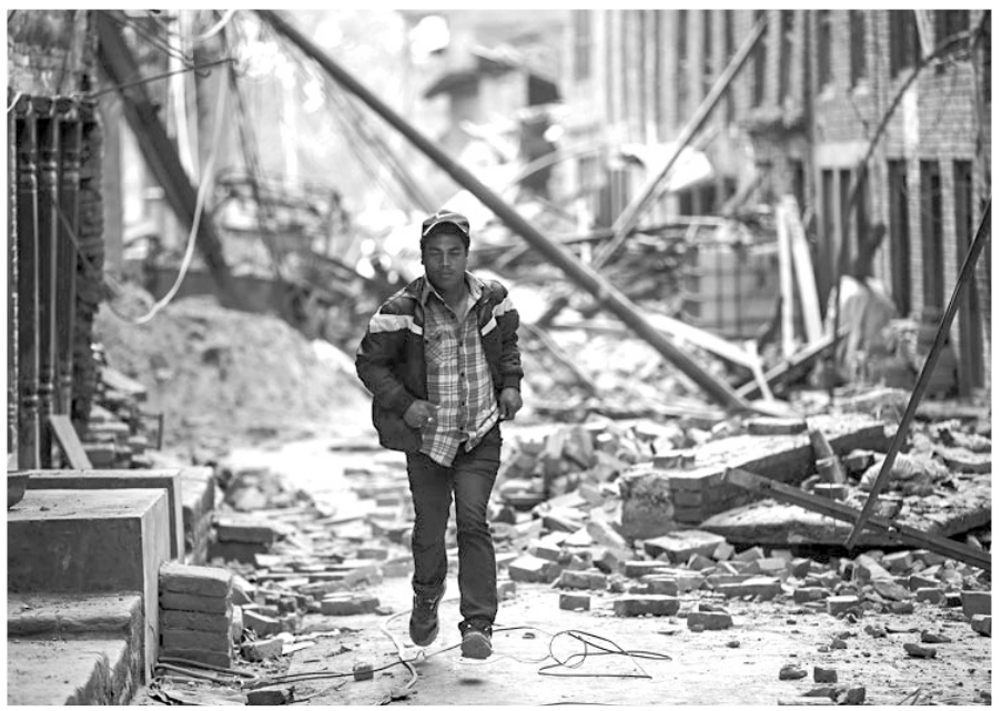
A man runs past damaged houses as aftershocks of an earthquake are felt a day after the earthquake in Bhaktapur, Nepal April 26, 2015. Rescuers dug with their bare hands and bodies piled up in Nepal on Sunday after the earthquake devastated the heavily crowded Kathmandu valley, killing thousands, and triggering a deadly avalanche on Mount Everest.