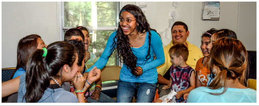
The youth group at the Potter's House enjoys a game together.

becoming a nurse, but there were many obstacles. Her parents brought her to the U.S. when she was two years old, so she was not eligible for state or federal financial aid or other privileges.