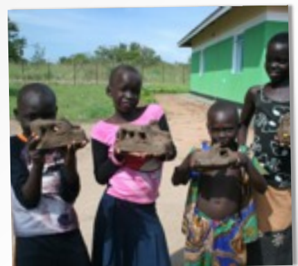
TOY TRUCKS MADE FROM MUD