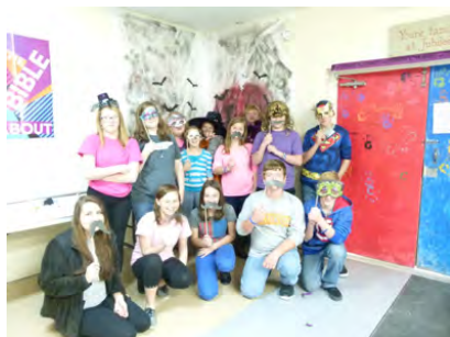
Youth striking a pose in the photo "BOO-th"

This year we have a group that really enjoys cooking and crafts, so we've been sharing cooking tips and letting them make things they can take home to share with their families. That is... if there's enough left after our meeting!