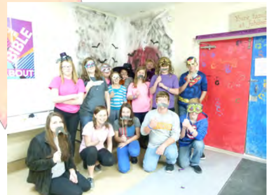
Jubilee youth having fun in the "Photo BOO-TH" for their fall bash.