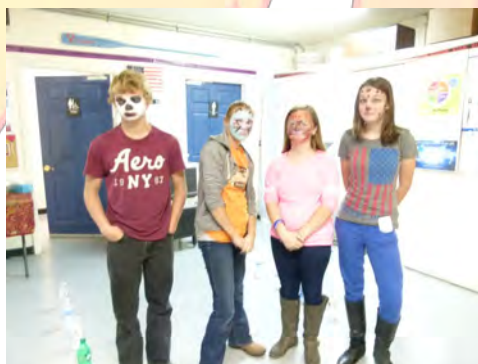
Fun with face painting

We are wanting to have the disposable pans so we can show the youth how to make a casserole they can take home and bake for their family.