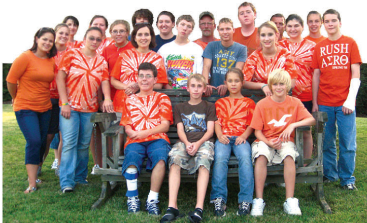
JOHNSON CITY: Eden goes hungry but doesn't stop serving.