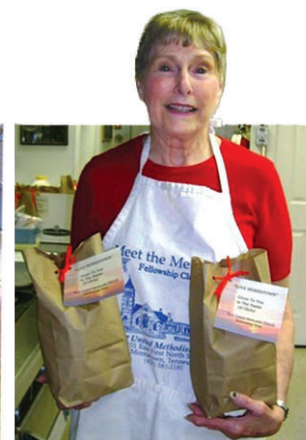
MORRISTOWN: Love ya'