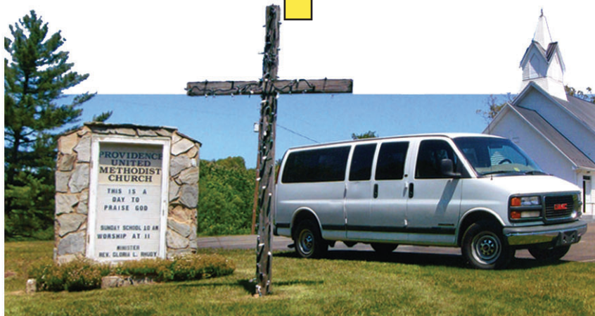
WYTHEVILLE: Providence plants its money into Camp Dickenson.