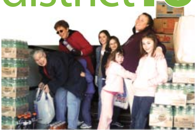
ABINGDON: Shady Grove loads 2 1/2 tons of food