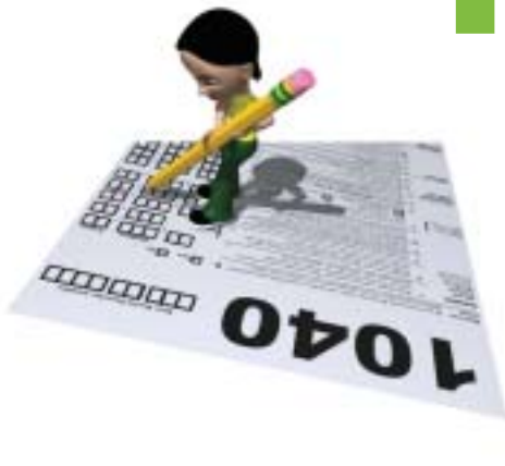
CHATTANOOGA: Tyner gives tax relief