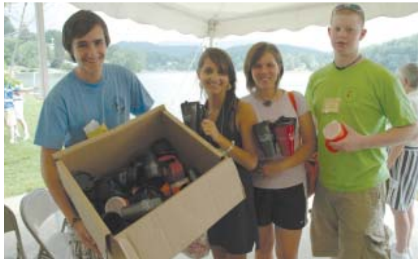
The Conference Council on Youth Ministry seeks donations for their logo cups.