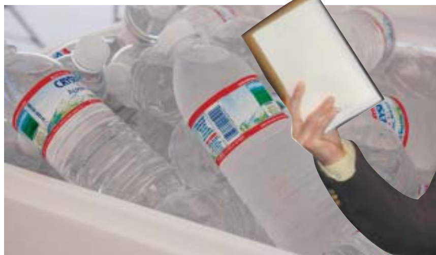
Members drank oceans of bottled water as temperatures soared into the 90s.