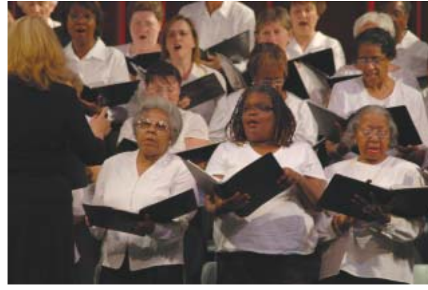
The First-Centenary UMC Chancel Choir sings for a packed house in Stuart Auditorium during the "Duke Ellington Sacred Concert" on Tuesday night.