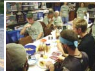
Ministering to hikers on the Appalachian Trail