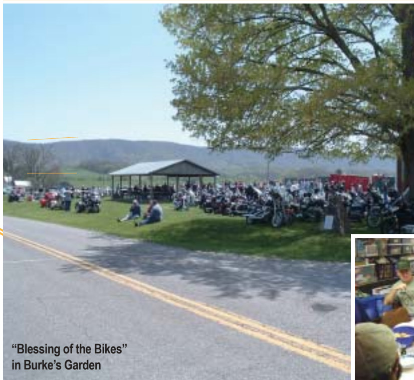
"Blessing of the Bikes" in Burke's Garden