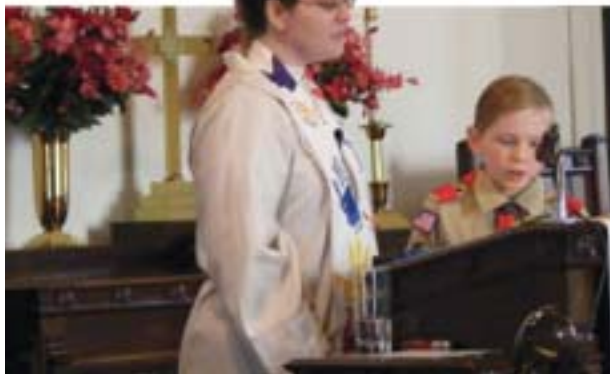
ABINGDON: Scouts in the pulpit at Meadowview