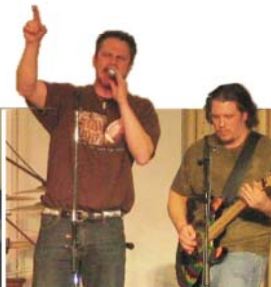
WYTHEVILLE: Wythe Cluster concert for youth