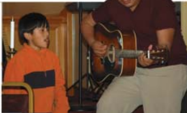
MORRISTOWN: Bilingual revival at Noe's Chapel