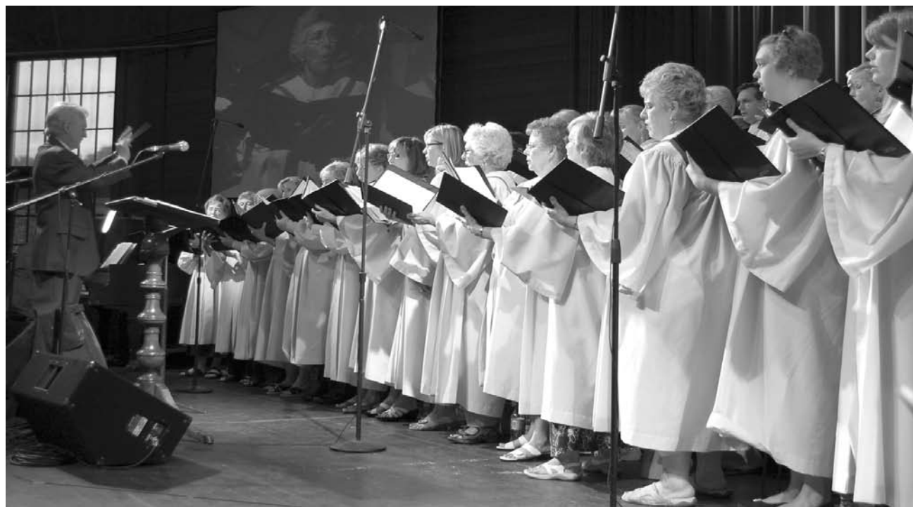
The First Maryville UMC Chancel Choir sings at last night's ordination service, which included 18 ordinands.

• The Sudan offering total will be announced Wednesday during the Sending Forth Service. ■