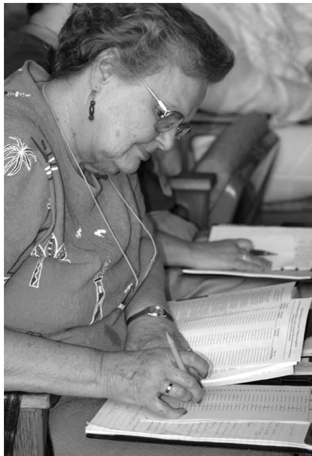
A member marks her ballot for 32 amendment votes.