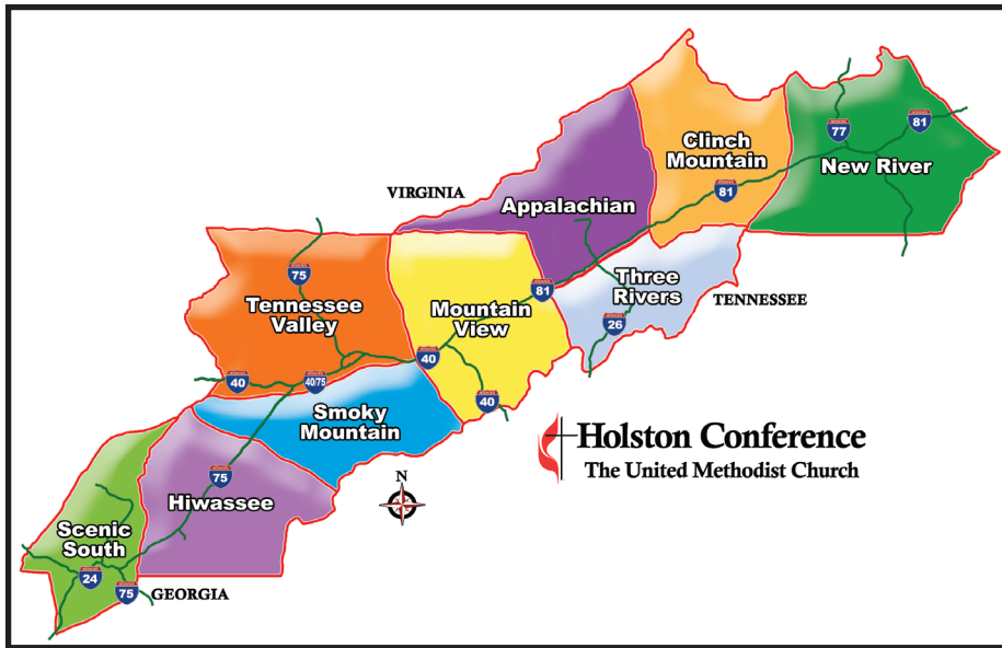
Holston Conference The United Methodist Church December 14, 2017