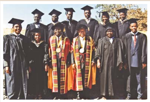
Graduates of Africa University offer leadership and new ideas for a continent struggling to survive. These young adults are the hope for tomorrow.